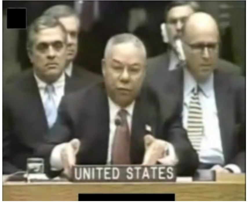
Hans Blix, March 7, 2003 <a href="http://www.youtube.com/watch?v">http://www.youtube.com/watch?v</a> =IImVN1dmGuY