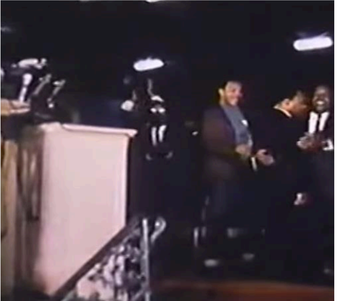
Figure 5: Here the camera shows us what happens 'backstage'.

So when asked to comment on this, my students - being well versed in the academic slang of our Communication department - can tell me that the film clip offers us more information about the context and setting of the speech, elements that were missing in the written text - and some explanatory notes would be needed if one were to evaluate the written text properly. But even so the film clip still appears to offer us, in a much more realistic sense than the other types of presentation, the historical and cultural