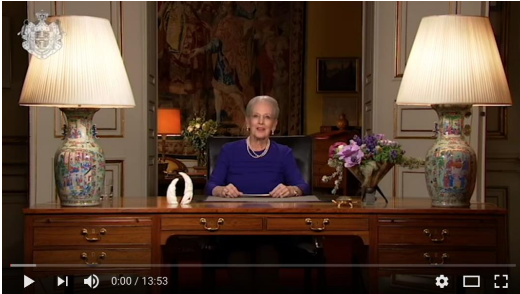
Danish Queen's New Year's address, 2017(-18).

https://www.youtube.com/watch?v=fvBvqR4D_xl&t=726s