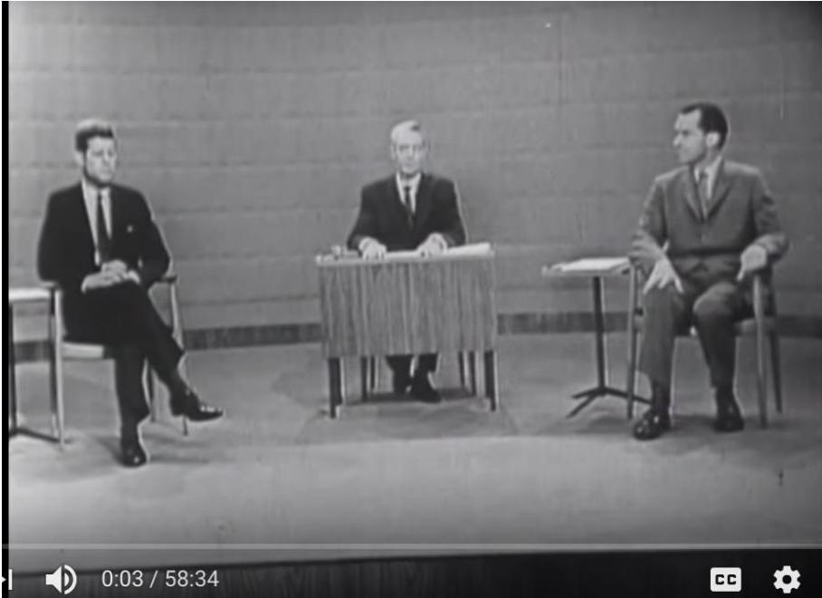
Kennedy versus Nixon 1960 presidential election debate. https://www.youtube.com/watch?v=gbrcRKqLSRw&t=2428s

though it has later been questioned if the two polls were actually comparable, the story goes that television viewers favored Kennedy whereas radio listeners favored Nixon: "Television audiences thought Kennedy won the debate by a landslide, while radio audiences thought Nixon won it by a landslide" (Power).