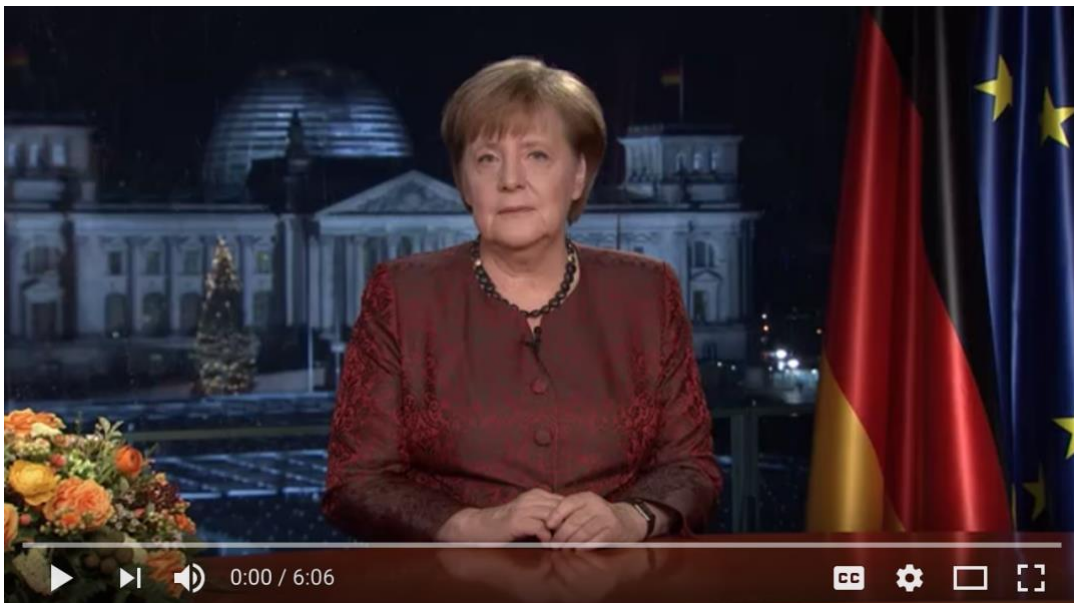
German chancellor Angela Merkel's New Year's speech for 2018.

So, a zoom out at the end of a political speech or debate on television is quite standard procedure. One example of this is the German chancellor Angela Merkel's New Year's speech for 2018. During the entire main part of the 6 minute long speech the camera stays zoomed in at a fairly close head-and-shoulder shot. There are, however, within this main setting some very small movements in the zoom, hardly noticeable unless one runs the recording fast forward or backwards. This is not due to sloppy camera work, on the contrary it is just a skilled way of adding a bit of life to an otherwise rather stiff appearance of the speaker. These small adjustments - movements almost as if the camera was slowly breathing or adjusting its stance - can be seen in many other examples of portraying a politician on TV (even as early as 1969 as we shall soon see).