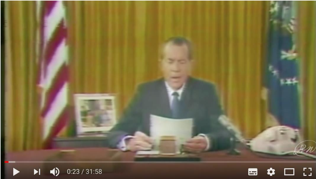
Richard M. Nixon's Great Silent Majority speech, 1969.

https://www.youtube.com/watch?v=TpCWHQ30Do8&t=752s