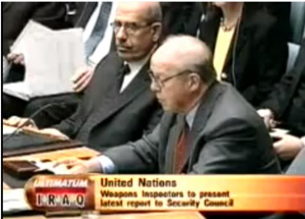
Hans Blix, March 7, 2003

http://www.youtube.com/watch?v=IlmVN1dmGuY