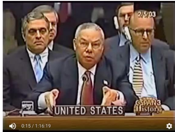
Colin Powell, Feb. 5, 2003

http://www.youtube.com/watch?v=IlmVN1dmGuY