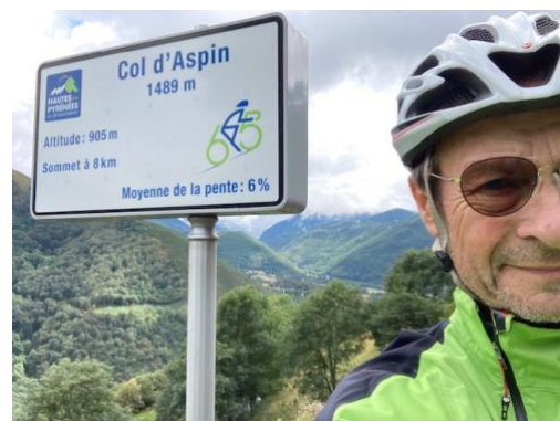
Cold d'Aspin, 2023

I have a passion for great films late at night, for climbing mountains on my superlight racing bike, for driving long roads to France, for meeting my old Viking Ship Friends, for enjoying and reflecting on nature, and so I am: