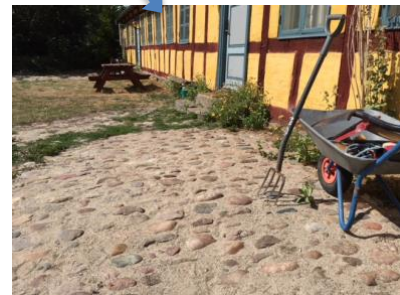
Sødingevej 9, 5750 Ringe, Denmark

My main academic background is in Philosophy (Critical Theory, Hermeneutics, Phenomenology, all the great Germans and Greeks) - but I dabble into many aspects of the humanities: aesthetics, communication, rhetoric & film studies - including practical video production. and oral presentation.