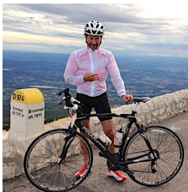
Mont Ventoux x 3 on same day, 2015

Before settling at Roskilde University, I had scholarships and teaching jobs at 5 different Danish universities. At Roskilde University I have mainly been teaching on the International Track, Communication Studies. As of December 2023, I have retired, but continues as an emeritus and as a censor (external examiner) at various other Danish Universities.